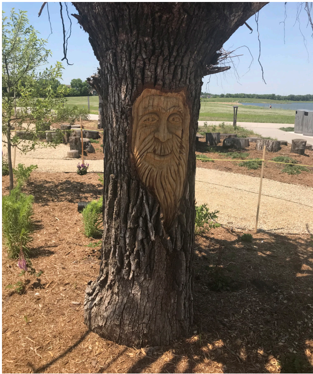
Rochester Cascade Lake Park