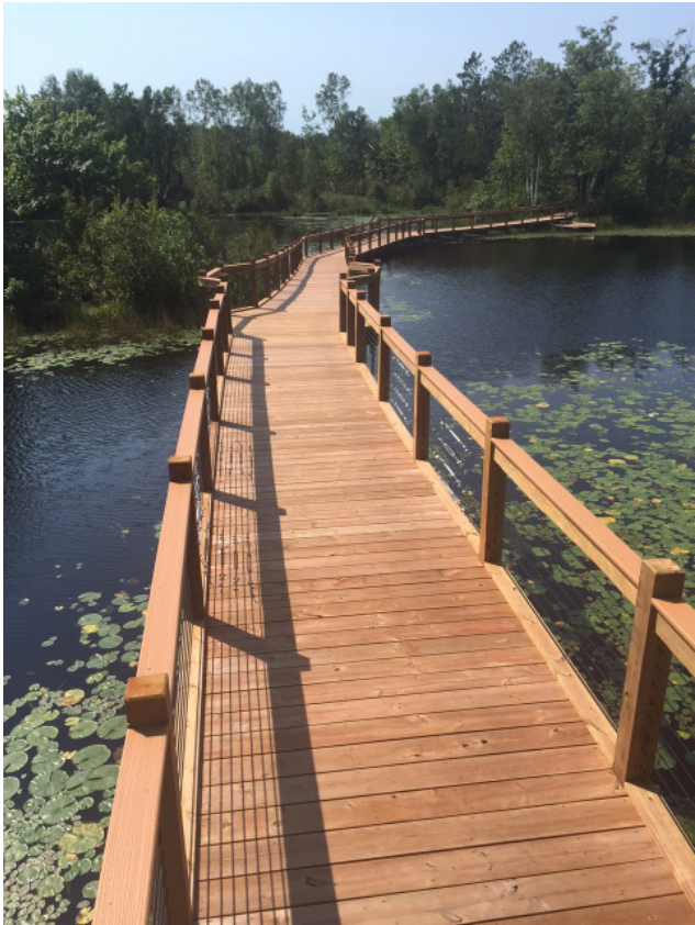
Crow Wing County Milford Mine Memorial Park